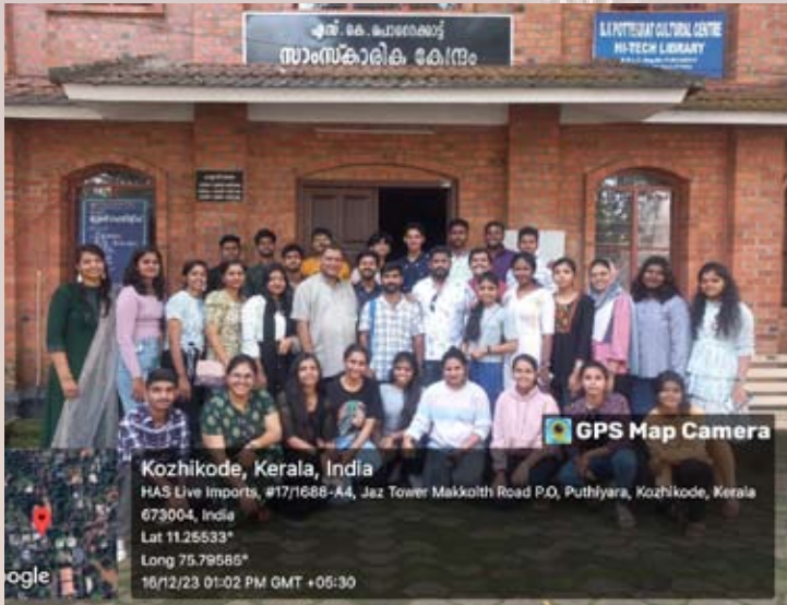
Purapad , a Study Tour organised by Folklore Club, YIMS for the club members on 16th December 2023.