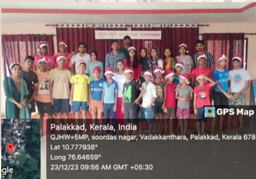
Second B. Com Taxation students visited Krishna Jyothi-Balasathanam and Mathrujyothi Old Age Home by providing morning breakfast and celebrating Christmas with the inmates.