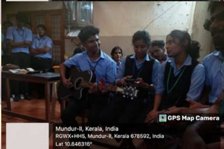
PG Department of Commerce Section Finance celebrated Christmas with the inmates of Shandhal Bhavan, Poriyani on 20th December 2023.