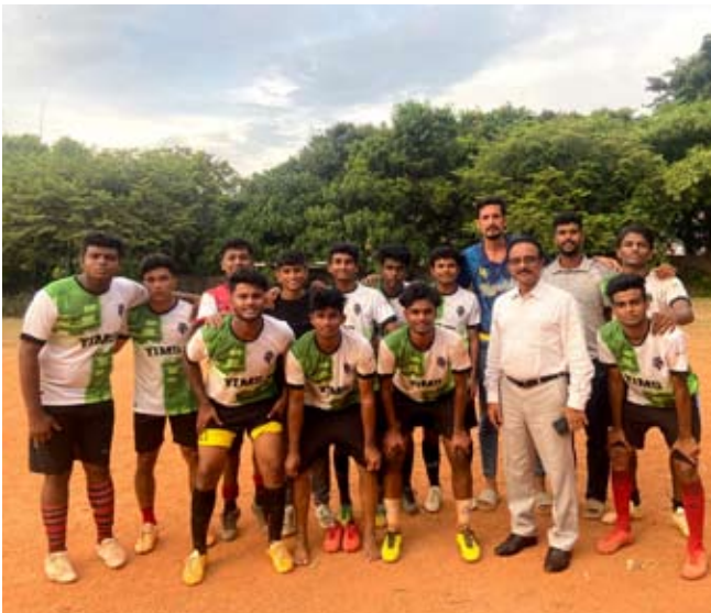
Runner-up - Department of Hotel Management