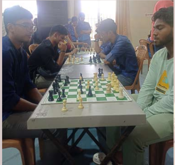
YIMS Chess Team Participated in Inter-Zone Chess Championship held at Al-Shifa College of Arts and Science.