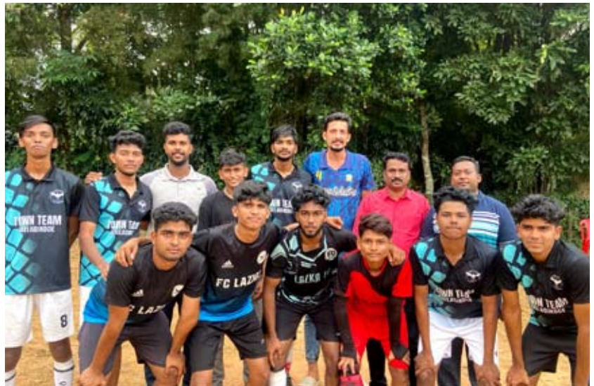
Second Runner-up - Department of Taxation