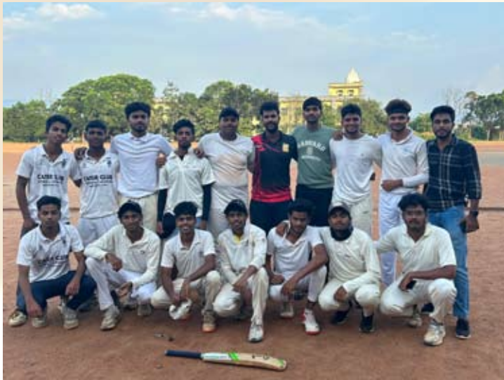
YIMS Cricket Team won Third Match against IHRD College, Malampuzha in the C Zone Competition of the University of Calicut.