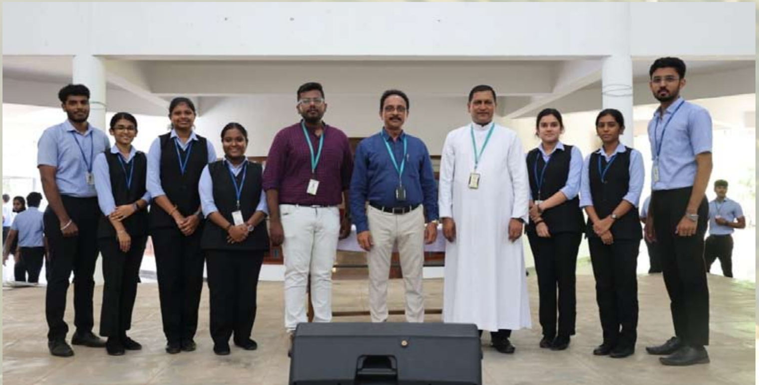
Assembly by I B Com Finance A Batch on 11. 12. 2023