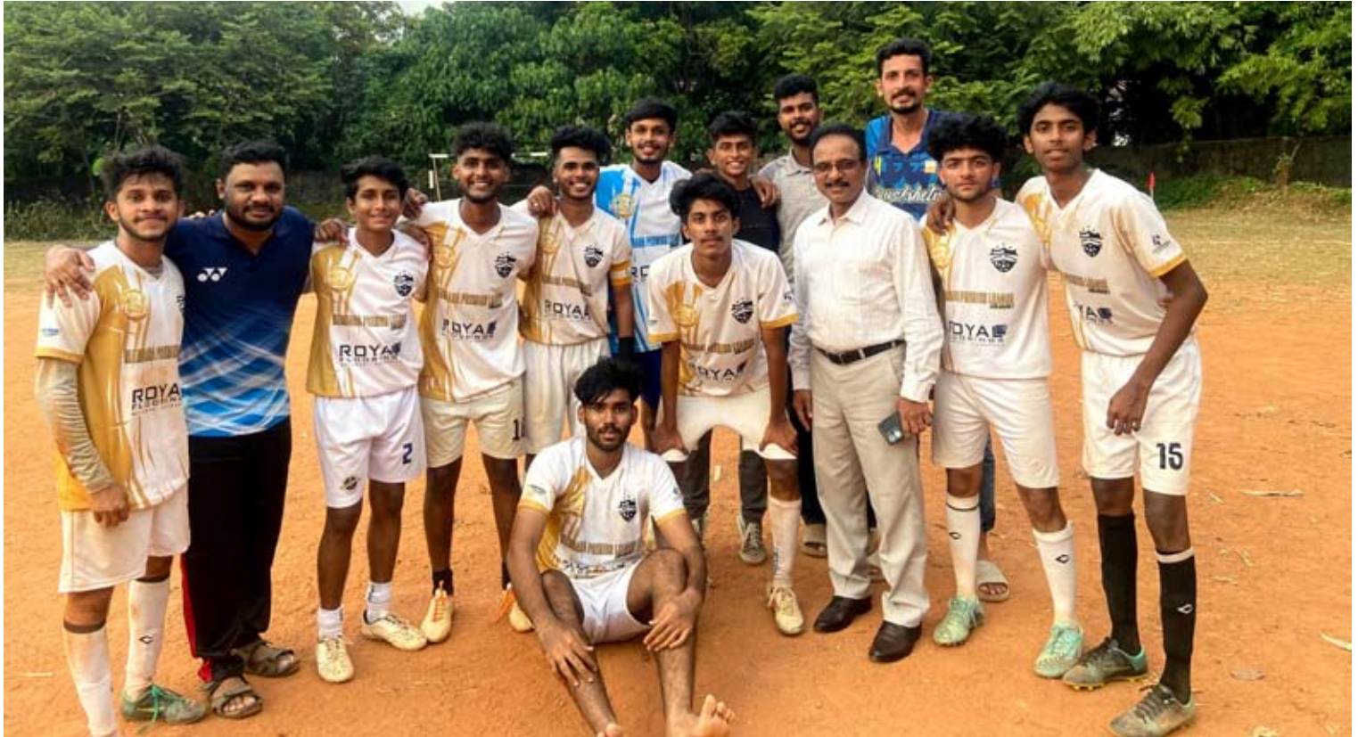
Winners - Department of Geography