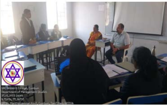
SPI Women's College, Cumbum Department of Management Studies 27.01.2023 14:49 9.71076, 77.16737 Sri St. Marthas (Women's Coll), Cumbum, Tamil Nadu - 625516