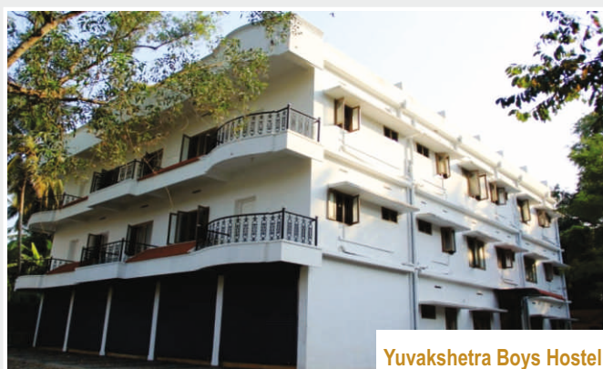
Yuvakshetra Boys Hostel