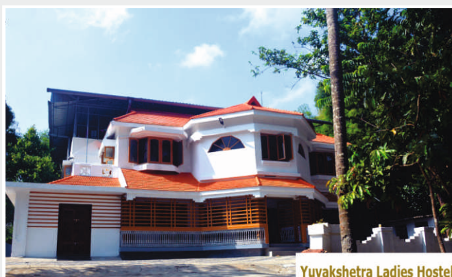
Yuvakshetra Ladies Hostel