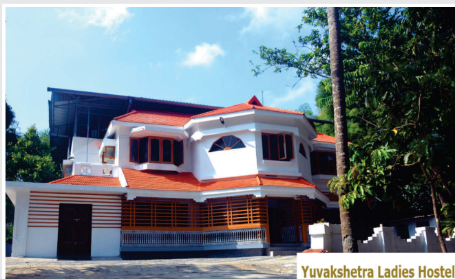
Yuvakshetra Ladies Hostel