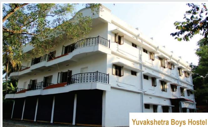
Yuvakshetra Boys Hostel